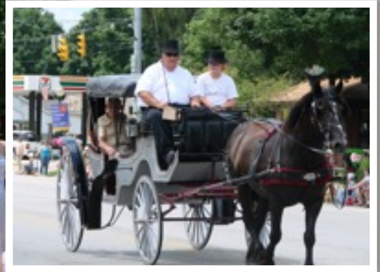
THE SATURDAY PARADE DOWN BRISTOL INDIANA'S MAIN STREET IS THE HIGHLIGHT OF THE DAY