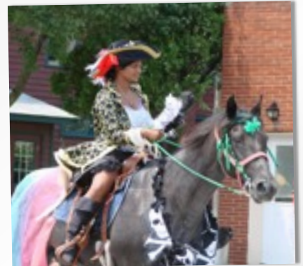
LADY PIRATE & HER HORSE