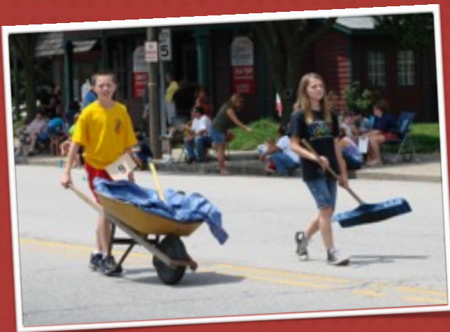
PROUD BRISTOL BAND STUDENTS PLAYED, THE SHRINERS RODE, & THE HUMANE SOCIETY AND CLEANUP CREW MARCHED ALONG