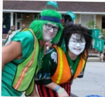
THE CLEANUP CREW