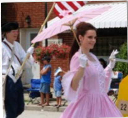
SONS OF AMERICAN REVOLUTION

Court, Princesses and the Senior Queen all rode on the 60-foot long Pirate float, made by the contestants and helpful volunteers. They were joined by a group of eager marchers and riders who paraded proudly down Bristol's main street on Saturday.